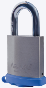
AEG-SPL-P207 STAINLESS STEEL SHACKLE Unit Price RM360 (30 pc/carton)