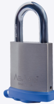
AEG-SPL-P208 ALLOY STEEL SHACKLE Unit Price RM360 (30 pc/carton)